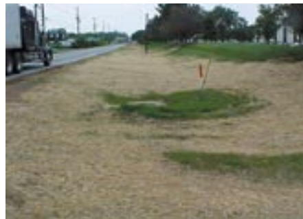
Flooding problems are resolved with drainage improvements like this construction project along Grade Lane.