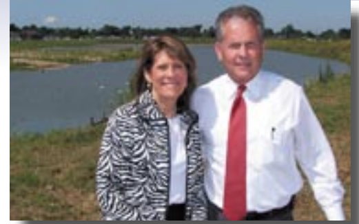
Congresswoman Anne Northup and MSD Executive Director Bud Schardein announced new flood protection initiatives at one of MSD’s flood protection facilities, the Bashford Manor Flood Storage Basin.

The objective, according to MSD’s David Schafflein, is to reduce loss of life and property damage during floods. The properties identified for removal and elevation were located in a floodway or floodplain and had histories of flood damage.