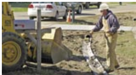
A contractor works on final restoration after installing a roadside paved swale as part of the Toebbe Lane DRI project.