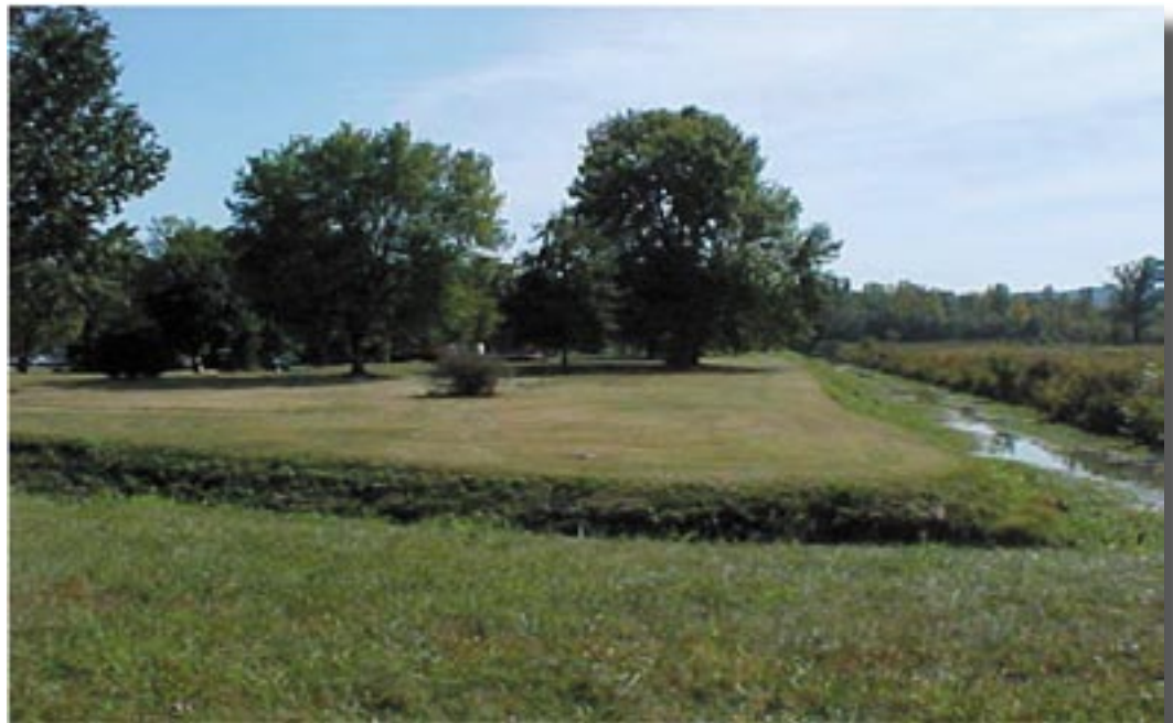
A flood-prone home once stood at this location that has been restored as a natural wetland. Projects like this limit loss of life and property should flooding occur.

The new projects will address flooding in Beargrass Creek and Pond Creek areas and will allow for a Southwest Flood Damage Prevention Study and sewer overflow mitigation. Additionally, flood storage basins will be constructed to store stormwater during heavy rains. Damaged and poorly performing infrastructure will be repaired to prevent flooding.