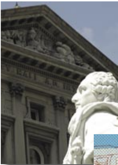
Louisville Metro Hall is protected against Ohio River flooding by the floodwall, but has the added protection of being elevated above the 100-year flood hazard level, according to HazMap, the community's new natural hazard portal.

“Our team is preparing a plan for HazMap's next phase,” he said. That will include connecting with FEMA's national Mapping Information Platform, real-time disaster declarations, citizen hazard fact sheets and components to complete the natural hazards section of the site.