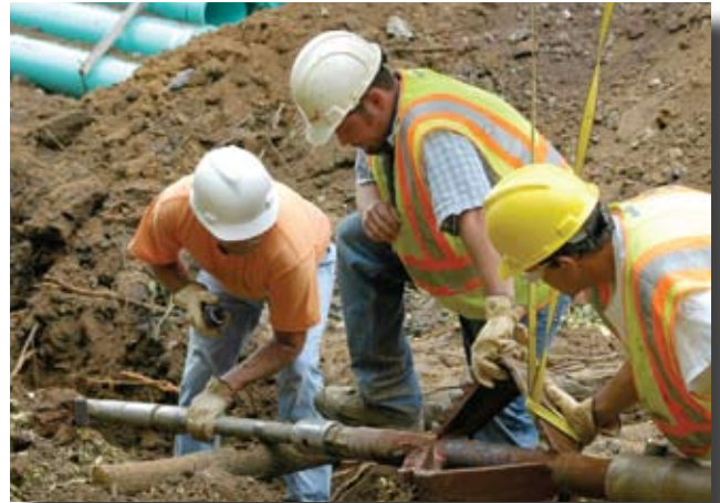
A construction crew installed a pipe under Story Avenue without excavating the roadway as part of a project to eliminate a combined sewer overflow.

Although the Project WIN program will take years to complete, the Louisville Metro Council, an advisory Wet Weather Team, and MSD customers have started the project on a path to success. Together with MSD, their commitment will ensure a higher quality of life and economic vitality for the Louisville Metro community.