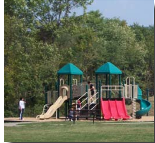
In addition to the existing greenway trail, playgrounds and sports fields are among planned upgrades to Riverview Park in Southwest Louisville.