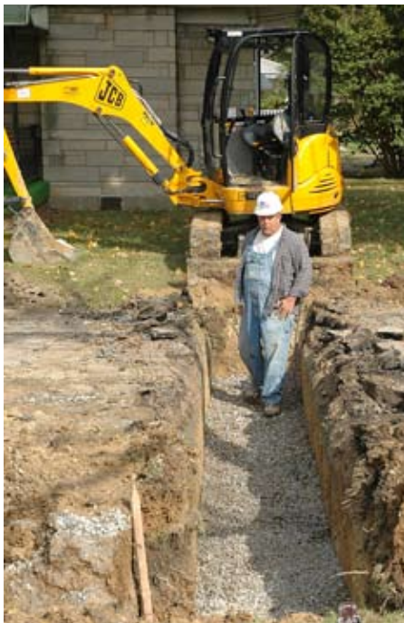
Project DRI improvements typically include construction of ditches or concrete paved swales either on a roadside or in rear-yard drainage channels.