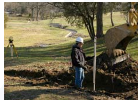
Contractor's crew regrades a drainage ditch flowing into a pond as part of a Drainage Response Initiative Phase 2 project.