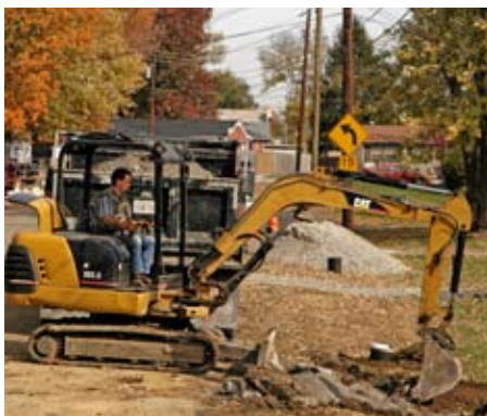
The goal of Project DRI is to provide a well-maintained and functioning drainage system for every neighborhood in the service area. Improvements range in estimated costs from $8,000 to $370,000.