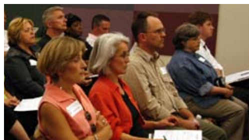
MSD held a public meeting at the Girl Scouts of Kentuckiana offices. Attendees learned about Project WIN and the changes they could make to improve water quality.

The meetings begin at 6 p.m. and start with an overview of MSD's Consent Decree and the challenges of reducing or eliminating sewer overflows. MSD will be available for the remainder of the meeting to talk one-on-one with residents about problems and potential solutions planned for their neighborhood. Attendees can view map displays of the locations of potential wet weather control projects, ask questions, provide feedback and voice concerns to MSD staff. Public input is highly valuable and encouraged as part of the planning process.