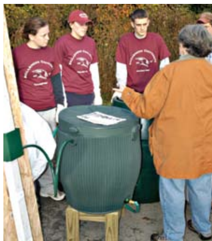
Several times a year, MSD holds demonstrations to teach community groups how rain barrels can help conserve water and prevent sewer overflows.