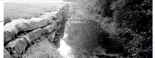
The Pope Lick Interceptor project required moving an existing sewer line along the creek bank and replacing it with a larger pipe. The creek was naturally restored using bioengineering methods.

keep driveways accessible to residents and reduce the time construction materials were stored. Once construction was completed, streets, driveways and yards had to be restored. State said most residents seemed satisfied that the restoration was more than adequate.