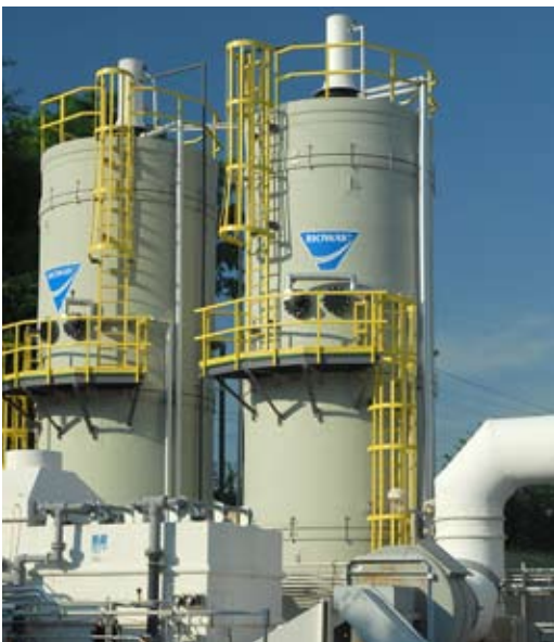
This biological control system is one of many odor control improvements at the Morris Forman Wastewater Treatment Plant.