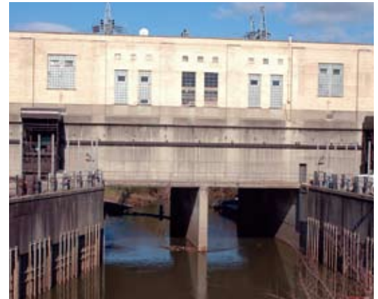
Beargrass Flood Pump Station