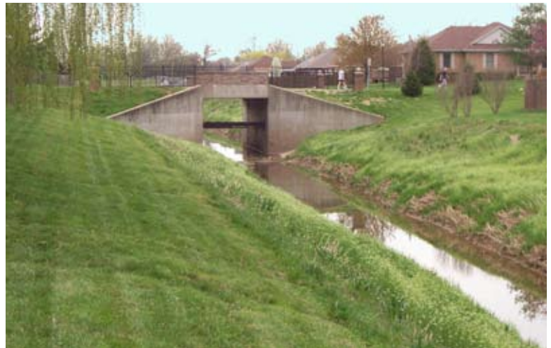
Major drainage channels and ditches located in or near residential areas are mowed three to four times per year.