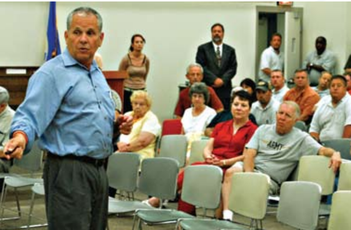
A series of eight neighborhood meetings will highlight MSD's Project WIN Integrated Overflow Abatement Program.

Visit the Project WIN Web site at www.msdlouky.org/projectwin for more information.