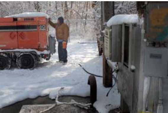
Donald Larue monitored and maintained an emergency generator to power the Glenview Hills Pumping Station.