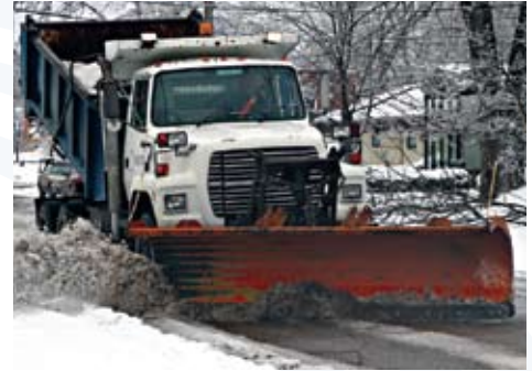
MSD staff and equipment were called in to plow and treat roadways throughout Louisville Metro.

The Louisville Metro area experienced its second severe storm within a six-month period when a devastating snow-and-ice storm struck our community January 27 through February 6. This storm was compounded by subfreezing temperatures, and 200,000+ local residences, businesses, schools and churches lost power because of the snow and ice.