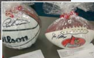
Louisville Cardinal balls were among the many items donated at the silent auction.