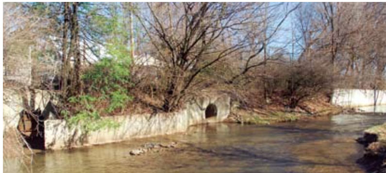
The Hikes Lane Interceptor will be constructed to eliminate the SSO along this portion of Beargrass Creek at the Highgate Springs Pumping Station.

The Hikes Lane Interceptor and Hikes Point Relief Sewer are two projects the Interim Sanitary Sewer Discharge Plan identifies for eliminating sanitary sewer overflows (SSOs) in the Hikes Point and Highgate Springs Pumping Station project area. MSD has negotiated with Strand Associates to prepare the final design for a 72-inch interceptor sewer from the Highgate Springs Pumping Station to the