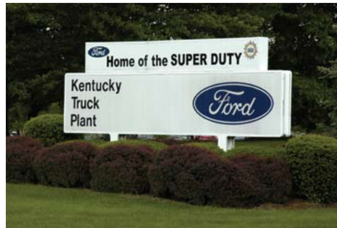
The Ford Kentucky Truck Plant is located on Chamberlain Lane.

MSD will buy 12 2009 Ford Focus sedans in order to support a vehicle brand that has an assembly or manufacturing plant within the Louisville Metro geographic boundaries, and provides employment for at least 500 people in its Louisville Metro facilities. Recently, the MSD Board approved the award of a contract to Bill Collins Ford—in the amount of $161,612—for 12 vehicles as well as the miscellaneous Focus service publications and on-site technical training for the repair and maintenance of these cars.