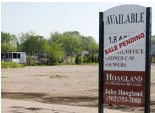
Employee parking at CMF will be expanded with the purchase of this property.