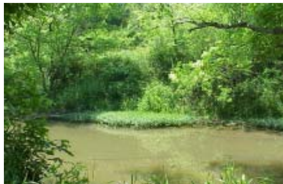
Figure 99. Typical Stream - Pennsylvania Run

The Pennsylvania Run watershed has most recently experienced flooding in March 1997. There is approximately 0.4 square miles in Federal Emergency Man-