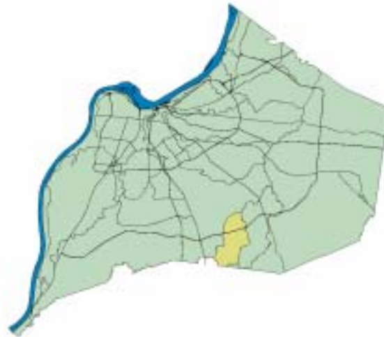
Figure 98. Pennsylvania Run Watershed

In 1990 (latest available census figures) the population of the Pennsylvania Run watershed reached 8,400. Table 82 illustrates the land use percentages.